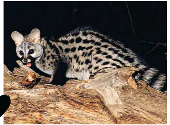
Links en bo: Kleinkolmuskeljaatkot (small spotted genet).

slange is DIE bloeddorstige, tieragtige, formidabele moordenaar van alle soorte kleiner soogdiere, jou maatjie. Die muskeljaatkot word uitgeken aan die pragtige swart en wit ringe om 'n wollerige stert.