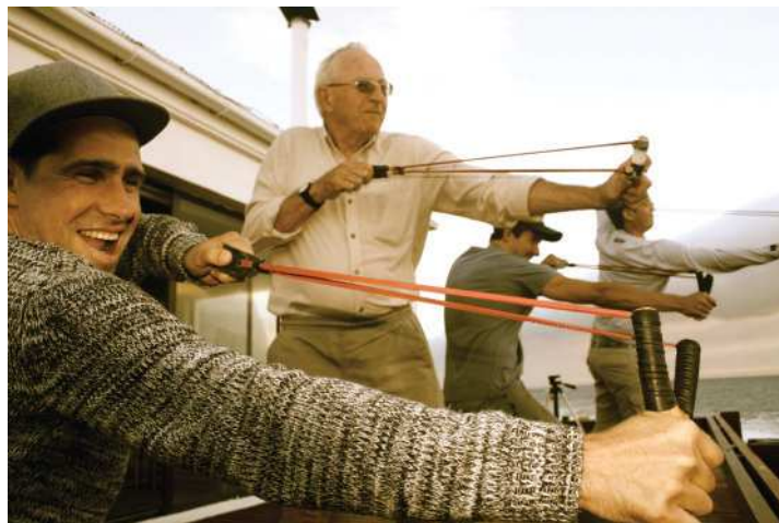
Above: the latest Boys' Weekend in November 2012

Our small paraffin-operated fridge was crammed with beers, bottles of wine and other necessities of life, so there was no room for the huge bowl of potato salad that the wife of one of the boys lovingly prepared every year. This meant it had to be devoured immediately, before it went off. Each time we explained what was lacking in this salad which was actually superb but which, in our stated opinion, only "bordered on greatness", and hence didn't quite merit "the freedom of the fridge". One year we felt the bacon wasn't quite crumbly enough and the eggs not from free range hens, next time the chives were lacking in piquancy and the third year the mayonnaise appeared to be shop-bought rather than homemade. Finally, we took pity on this ultrapatient "good wife" and bought an extra fridge for R200 which ran off a gas cylinder or a car battery. With due ceremony we installed the now-perfect potato salad in its own fridge in solitary glory, and enjoyed it every day instead of wolfing it the first night. (It featured again in a recent Boys' Weekend a couple of years ago and was better than ever, and I still have the R200 fridge, now