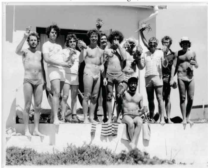
Below: the first Boys' Weekend in the mid-Seventies (I am third from right)