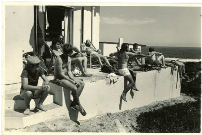
Above: an early Boys' Weekend - the start of the catapult tradition.

An evening at the Hangklip Hotel became a longlasting tradition. There was a chi-chi restaurant